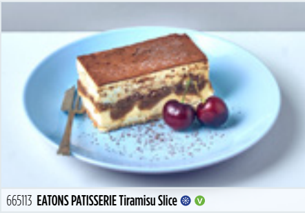
665113 EATONS PATISserie Tiramisu Slice