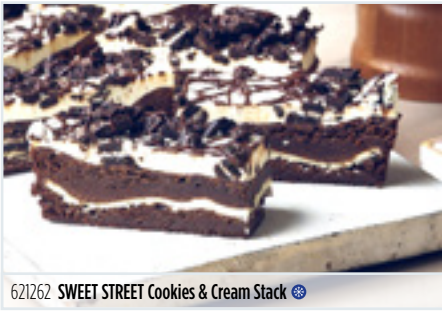
621262 SWEET STREET Cookies & Cream Stack