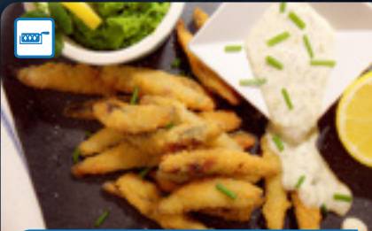
Blanchbait 254035 • 454g