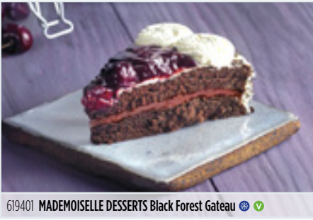
619401 MADEMOISELLE DESSERTS Black Forest Gateau