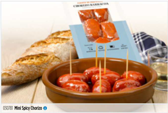
030781 Mini Spicy Chorizo