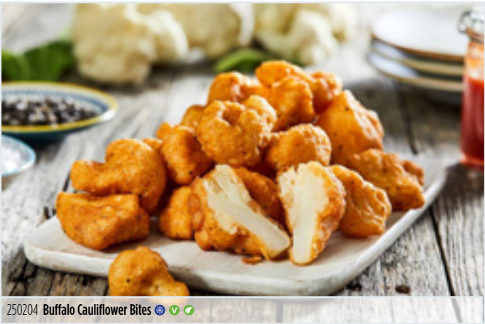
250204 Buffalo Cauliflower Bites