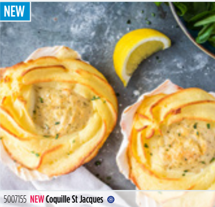
5007155 NEW Coquille St Jacques