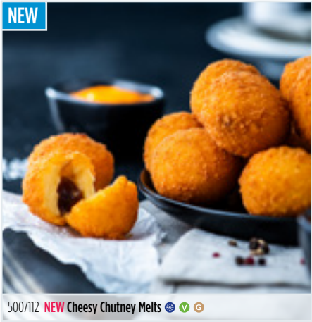
5007112 NEW Cheesy Chutney Melts