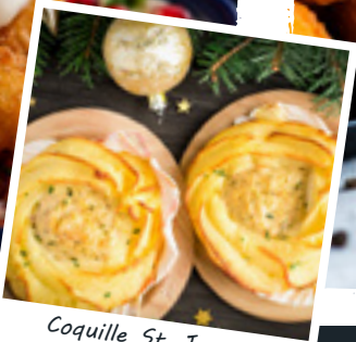
Coquille St Jacques