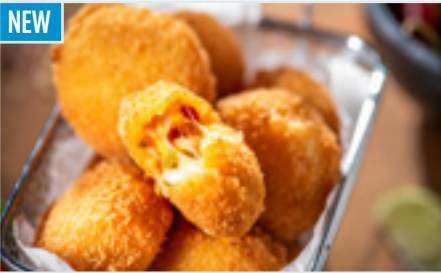
5007109 NEW Chilli Mozzarella Nuggets