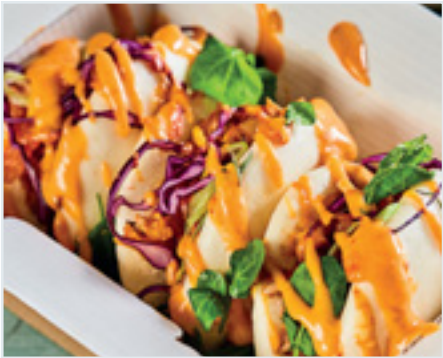
254031 PACIFIC WEST Jackfruit Filled Bao Buns