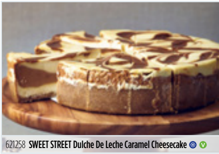
621258 SWEET STREET Dulche De Leche Caramel Cheesecake