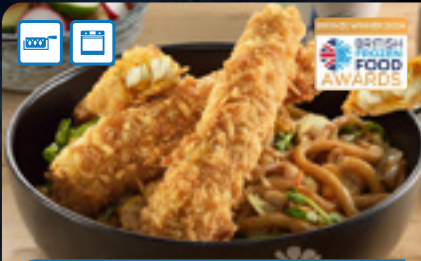
Panko Coated Katsu Fish Goujons 254018 • 1kg (40-60g)