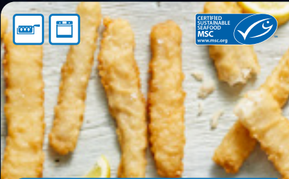
Crispy Battered Cod Goujons (MSC) 254022 • 1kg