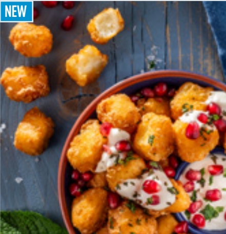
5007110 NEW Pop-a-loumi