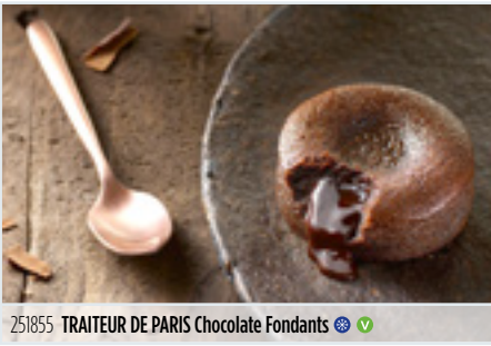
251855 TRAITEUR DE PARIS Chocolate Fondants