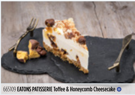
665109 EATONS PATISserie Toffee & Honeycomb Cheesecake