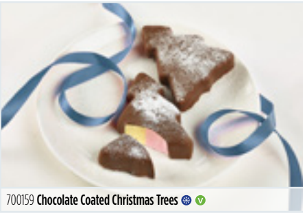
700159 Chocolate Coated Christmas Trees