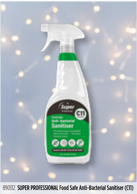
890312 SUPER PROFESSIONAL Food Safe Anti-Bacterial Sanitiser (CTI)