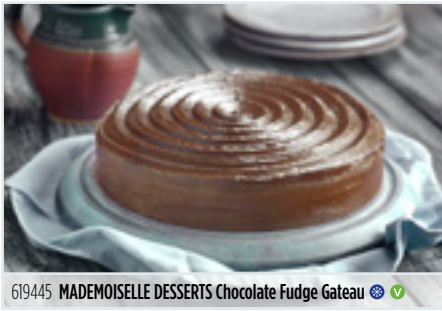
619445 MADEMOISELLE DESSERTS Chocolate Fudge Gateau