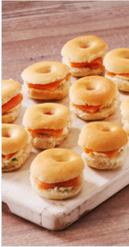
251466 FRANKDALE Smoked Salmon Cream Cheese Bagels