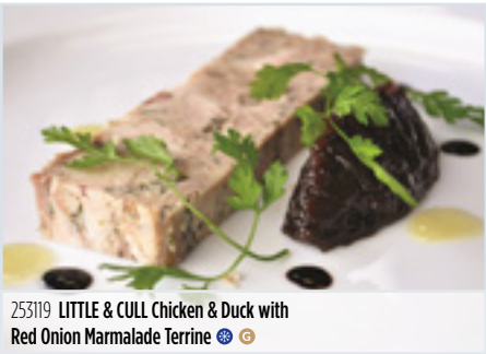
253119 LITTLE & CULL Chicken & Duck with Red Onion Marmalade Terrine

Click here to see our complete starters & buffet range