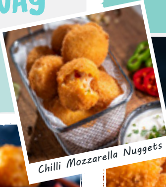
Chilli Mozzarella Nuggets