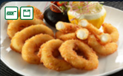
Plant Based Calamari Rings 254032 • 1kg