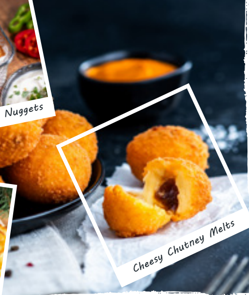
Cheesy Chutney Melts