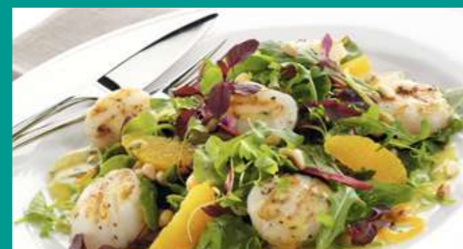
6 Seafood & Shellfish