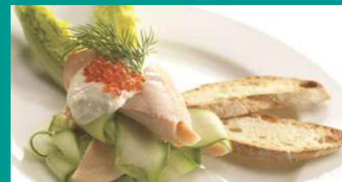
9 Smoked Fish