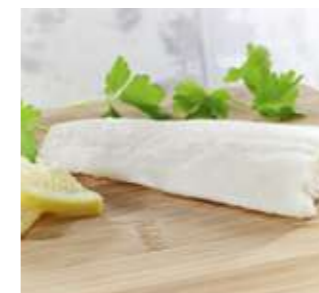
MSC Cod Fillets (230-290g)