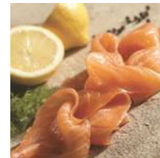
Smoked Salmon (Long Sliced)