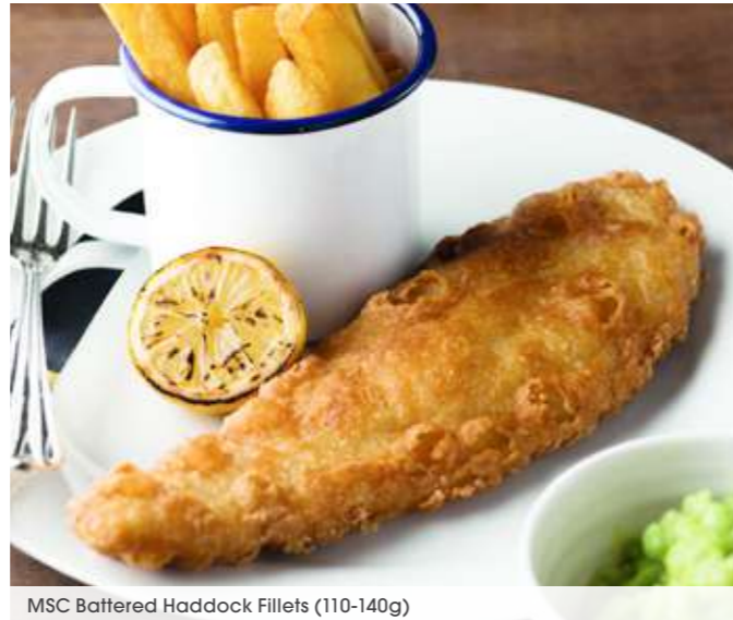
MSC Battered Haddock Fillets (110-140g)