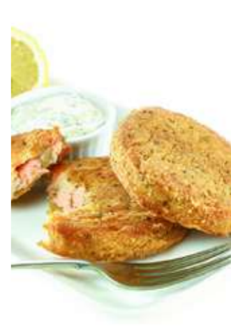
Luxury Salmon & Dill Fishcakes