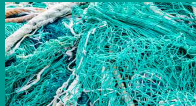
4 Sustainability & its Importance