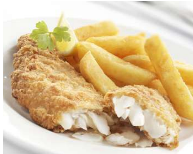
Breaded Cod Fillets (4-5oz)