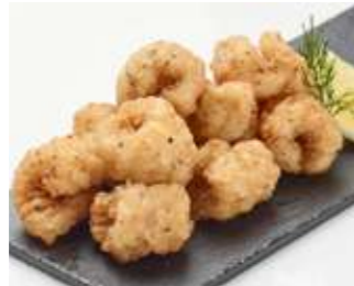
Salt & Pepper Squid