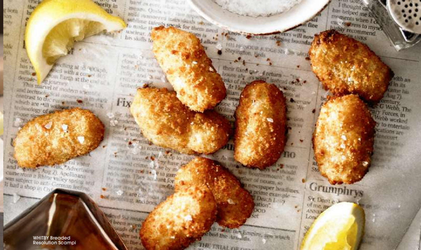
WHITBY Breaded Resolution Scampi