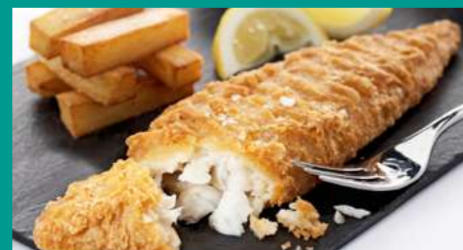
10 Battered & Breaded Fish