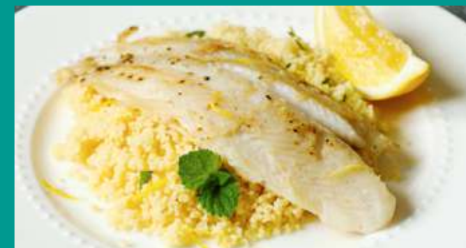
5 Your Local Fishmonger