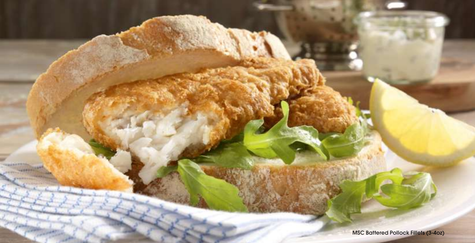
MSC Battered Pollock Fillets (3-4oz)