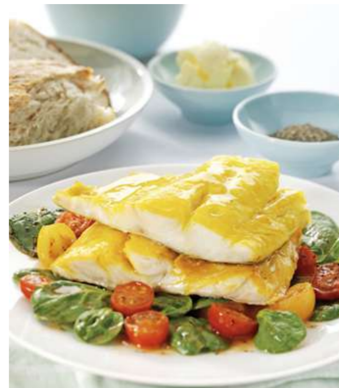
Smoked Haddock Fillets