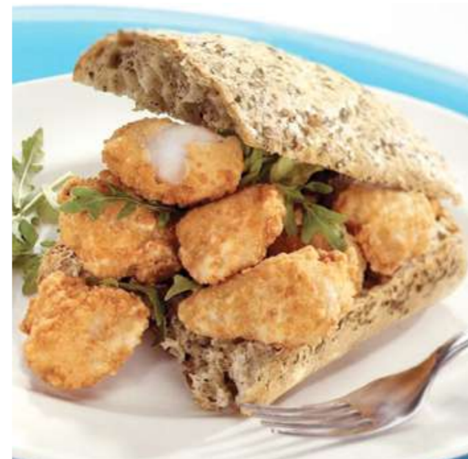
WHITBY Endeavour Breaded Wholetail Scampi