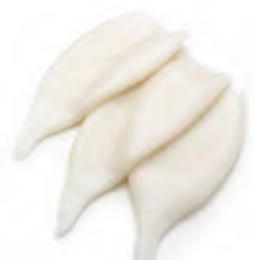
Raw Squid Tubes (30% Glaze)