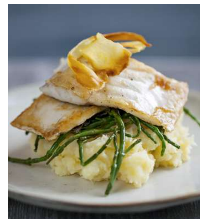
Sea Bass Fillets (4-5oz)