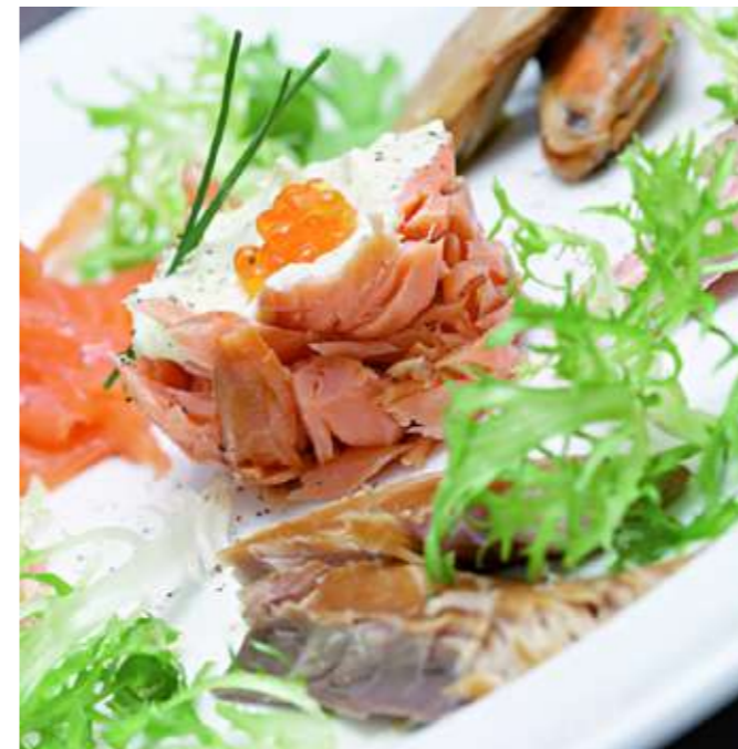
THE WEALD SMOKERY Hot Roast Salmon Unsliced Side (Fully Trimmed)