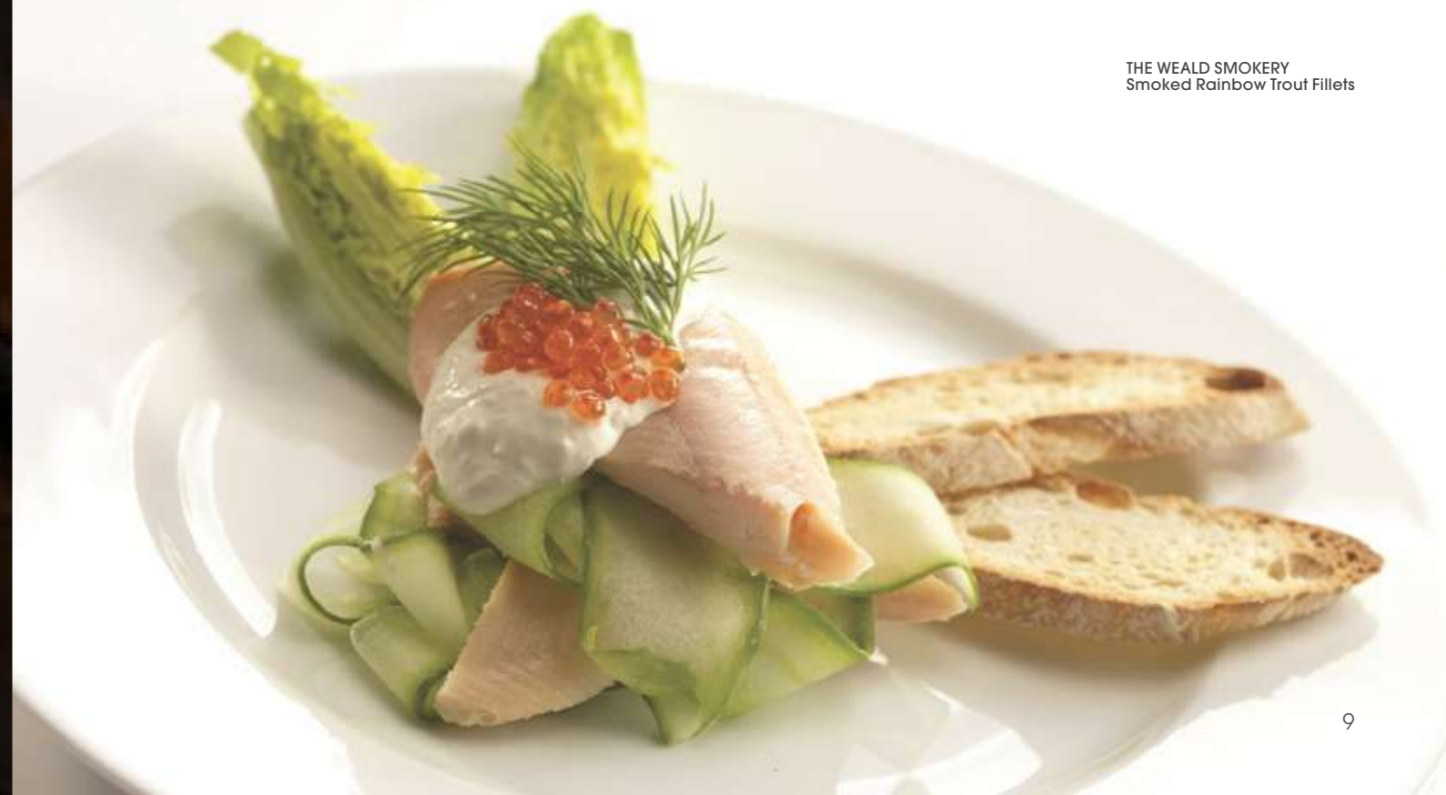
THE WEALD SMOKERY Smoked Rainbow Trout Fillets