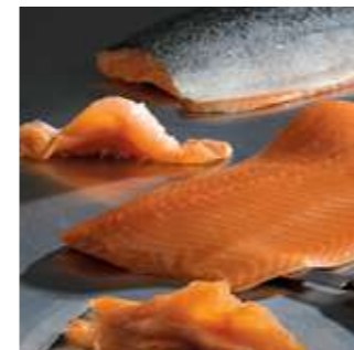
Smoked Salmon (D Cut)