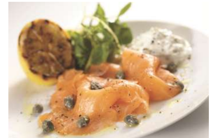
Smoked Salmon (Long Sliced)