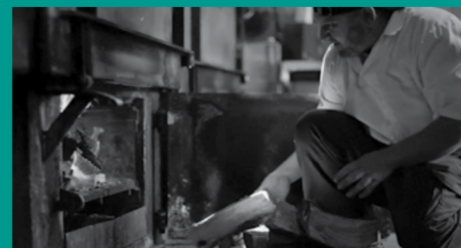
8 The Weald Smokery Story