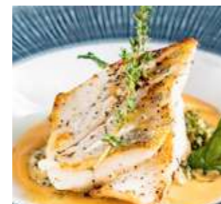
MSC Cod Fillets (6-7oz)