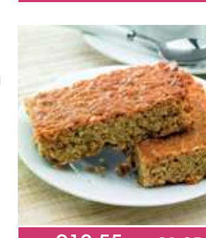
HANDMADE CAKE COMPANY All Butter Flapiack A traditional flapiack made using rolled and iumbo oats. Code 616625 Pack Size 1x12p/ptn