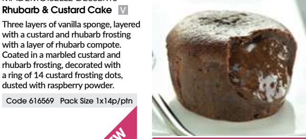
offer £17.68 Each 88p