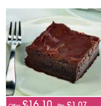
Offer £16.10 Ptn £1.07