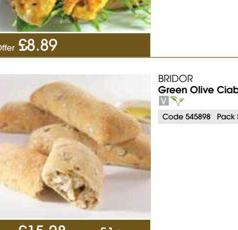
Green Olive Ciabattas Code 545898 Pack Size 30x140g