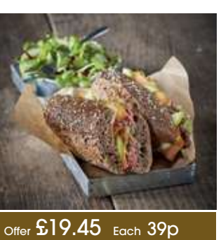
Rye & Cereal Half Baguettes Code 545902 Pack Size 50x120g