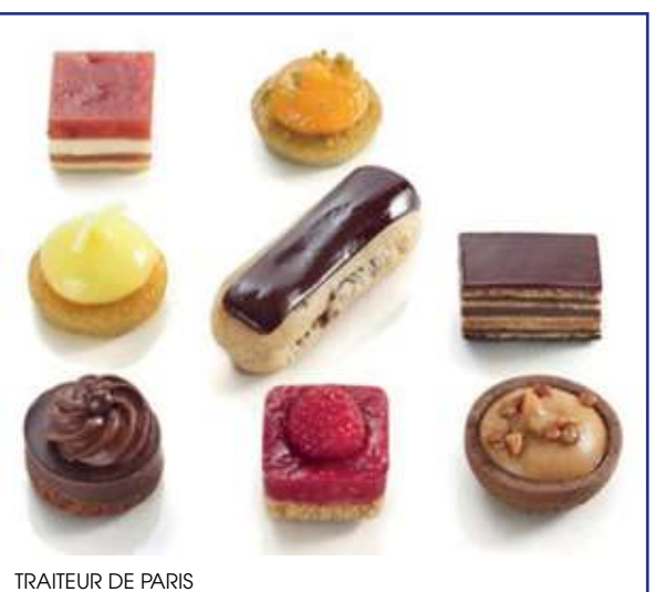
Traditional Sweet Canapés

Contains six of each flavour: Pistachio financiers: Almond biscuits with vanilla mousse & strawberry compote; Chocolate éclairs; Almond biscuits with lemon zest & lemon cream; Opéra cakes; Caramel crumbles; Raspberry crumbles; Chocolate crumbles.