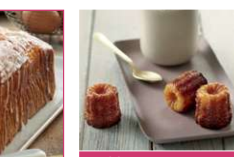
TRAITEUR DE PARIS Mini Canele Cakes V This pastry combines a soft, melting centre with a fine caramelised crust to offer your customers a wonderful play on textures. In addition, its very short list of high quality ingredients enables this little gateau to reveal its rum and vanilla flavours. Code 251896 Pack Size 1x80