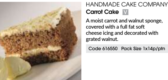
Offer $22.73 Ptn $1.62