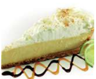
SWEET STREET Key Lime Pie Authentic Florida key lime....tartly refreshing on a granola'd crust. Code 621120 Pack Size 1x14p/ptn