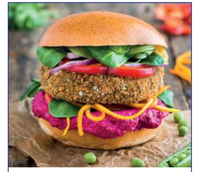
PARAMOUNT FOODS Aromatic Garden Burgers 🕞 🗸 🥎

A lightly spiced mix of broad beans, peas and spinach, coated in gluten-free breadcrumbs flecked with rice flakes and parsley.