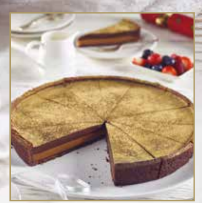
SIDOLI Golden Salted Caramel Tart A chocolate pastry case filed with a layer of salted caramel and dark chocolate filing sprinkled with a gold dusting. Code 662321 Pack Size 1x14p/ptn