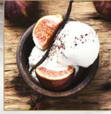
YORVALE Fia & Brandy Ice Cream Code 708113 Pack Size 5ltr

Diced turkey combined with sweetened cranberries in a creamy sauce encased in shortcrust pastry. Code 511959 Pack Size 12x360g