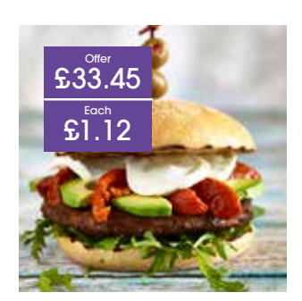
100% Aberdeen Angus Burgers