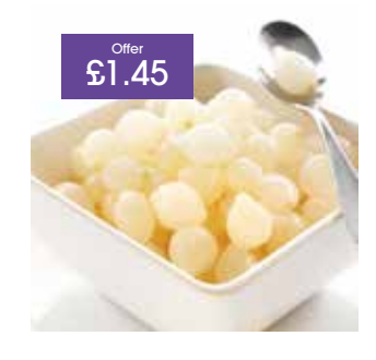
Whole Baby Silverskin Onions Code 204210 Pack Size 1kg

Code 208825 Pack Size 4x2.5kg Offer £7.65 Whilst stocks last