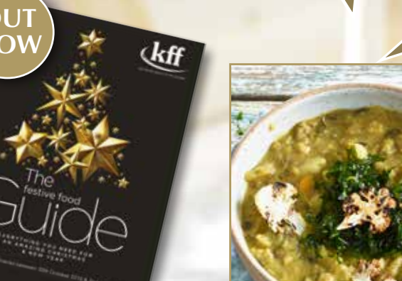
REDEMPTION Cauliflower, Lentil & Spinach Soup Code 022817 Pack Size 4kg

Get in touch with your kff sales contact to get your copy today!