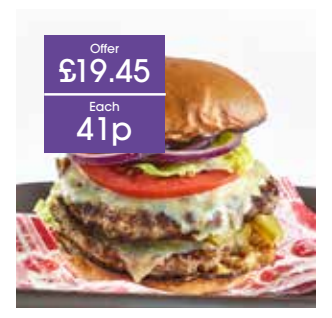
90% 4oz Beef Burgers Code 402830 Pack Size 48x113g

Chopped and shaped chicken with a buttery garlic filling in a golden breadcrumb coating. ode 414201 Pack Size 16x125g