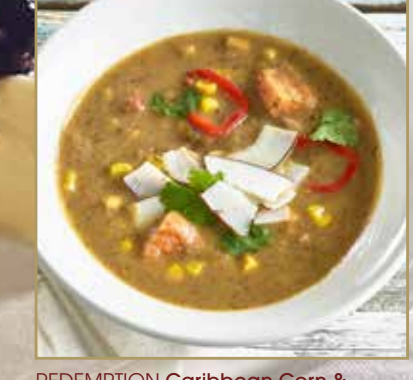
REDEMPTION Caribbean Corn & Coconut Soup Code 022818 Pack Size 4kg