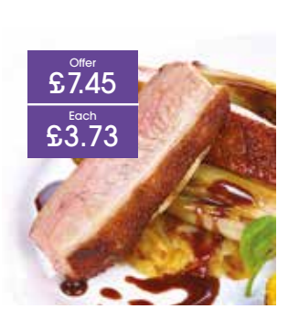
GRESSINGHAM Duck Breasts Code 403851 Pack Size 2x200g

Diced turkey combined with sweetened cranberries in a creamy sauce encased in a shortcrust pastry case. Code 511959 Pack Size 12x360g