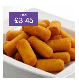
AVIKO Potato Croquettes Code 217656 Pack Size 2.5kg