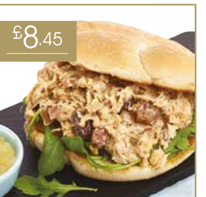
PURPLE PINEAPPLE Pulled Pork & Stuffing Filling* Code 012237P Pack Size 1kg

Our quality hand mixed fillings offer your customers all the flavours of Christmas without the painstaking preparation.