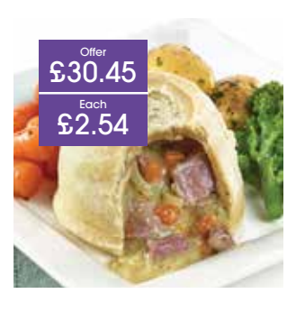
KENTISH MAYDE Ham Hock & Onion Puddings Chunks of flaked ham hock in