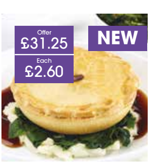
KENTISH MAYDE Turkev & Cranberry Pies

Pork and cranberry stuffing encased in slices of turkey breast, Code 412356 Pack Size 12x280g