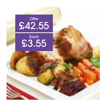
KENTISH MAYDE Turkey Parcels

Pork and cranberry stuffing encased in slices of turkey breast, Code 412356 Pack Size 12x280g